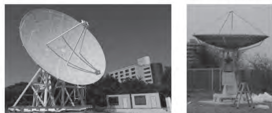
Fig.4 A part of introduction of IfES's latest radio antennas and their functions. The material was prepared by Sato.