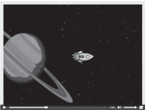
Fig.3 A screen shot of the solar system grand tour in Uchu Game.

Dušan performed together. Uchu Game, a package of electronic astronomy education materials developed by us, was presented (see figure 1). Children enjoyed the daily cycle of the Sun and the Moon motions with lovely characters, and the imaginary space trip by a nice rocket through solar system (see figures 2 and 3). Children were also eager to ask Dušan questions. Tomita translated children's Japanese into English.